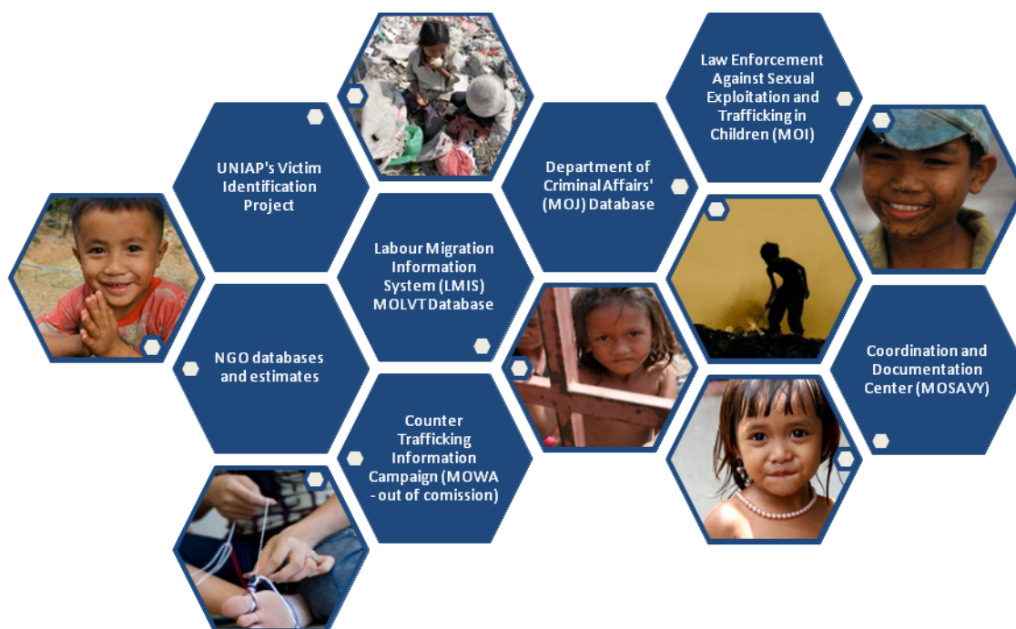
Figure 4 Current Existing Databases for Human Trafficking Victims