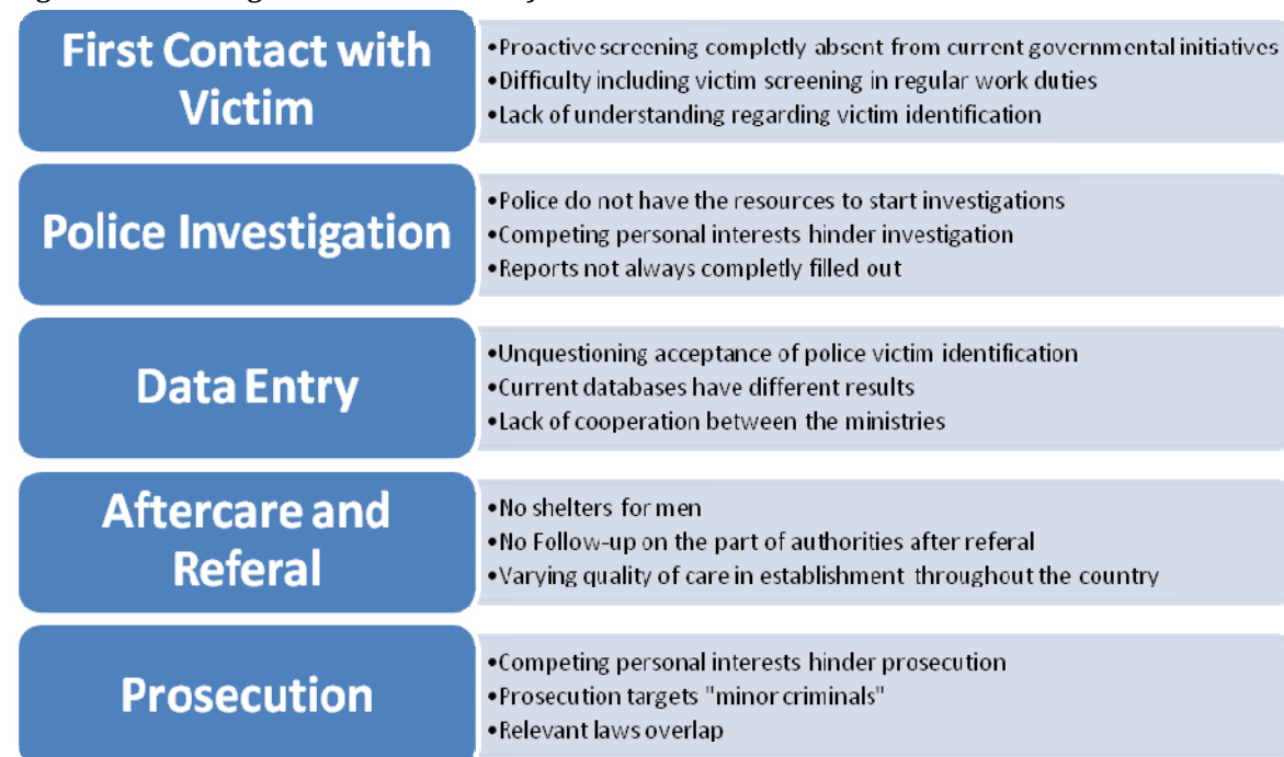
Figure 4 Challenges to Victim Identification

The resounding message gleaned from research was that a national standard for the identification of victims was incredibly important for the success of ongoing anti-trafficking efforts. However, that central conclusion was filtered through confusing, mixed messages from various stakeholders as to similar projects that are said to already be in progress. But ultimately, the very confusion that permeates information about centralizing initiatives only re-enforces our assessment that such a project remains needed and absent.