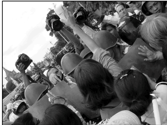
Figure 7.3: Mu Sochua supporters' peaceful protest blocked by riot police, 2 June 2010.