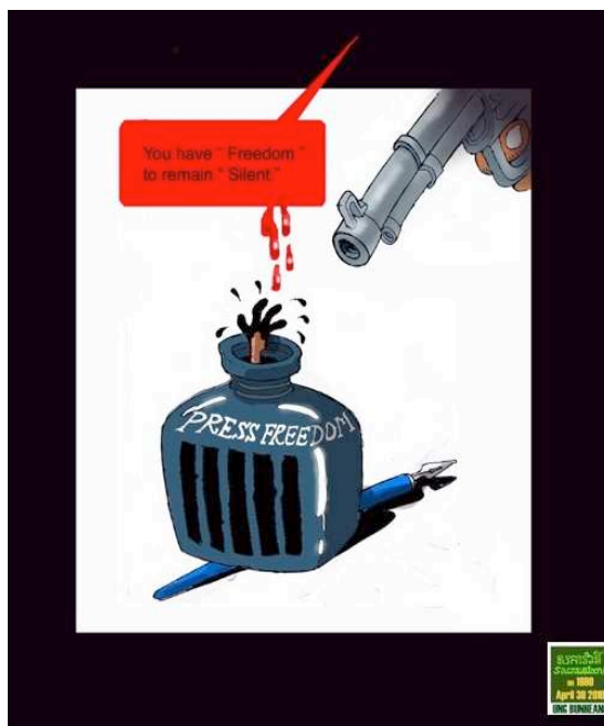
Figure 4.1: Cartoon by Sacrava, Sacravatoons No. 1690, April 2010

Despite the importance of a free, pluralistic media for the furthering of democracy, the AHRC has found that in Cambodia the pattern of freedom of press since 1993 has been one of overall decline with spurts of freedom over short periods of time. 89 Restrictions have swung wildly between freedom and repression and as such the press "cannot be described truly as free." 90 Since 1993, eleven journalists, most recently Khim Sambo of opposition paper Moneaksekar Khmer , have been killed. 91 To date no arrests have been made in relation to the murder of Khim Sambo. Journalists continue to be threatened and harassed, with defamation cases against journalists being used to stifle debate and discussion. Opposition papers have