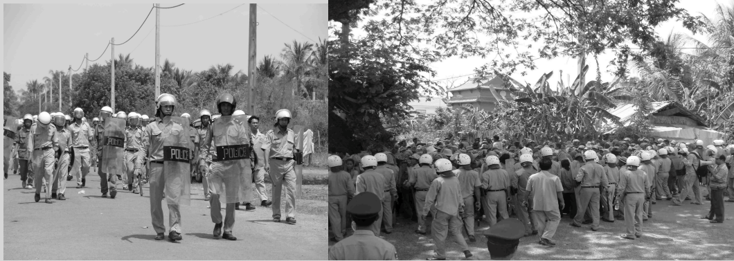
Figure 7.2: Military police face peaceful protestors in Kompong Speu, March 2010

Following the arrest and detention of two community representatives, You Thou and Khem Vuthy, in connection with a land dispute involving Phnom Penh Sugar Company, which is owned by CPP Senator Ly Yong Phat, affected villagers drove to Kompong Speu Provincial Court. Villagers drove for hours to stand outside the courthouse in a show of solidarity with the arrested representatives. Police forces (made up of a mixture of criminal and military police) attacked their convoys with batons, disabling one mini-tractor by cutting its drive belt and setting up checkpoints to impede villagers' progress. 179 NGOs monitoring the situation reported that at least 3 villagers were beaten and 7 suffered minor injuries. The actions of the mixed police force represent an unpalatable infringement on freedom of expression and freedom of assembly, denying those affected by the land dispute the opportunity to voice their concerns.