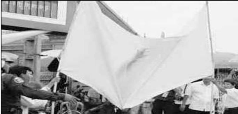
Figure 6.1: Police tear down screen that union members and protestors were using to show the film 'Who shot Chea Vichea?', May 2010

Police also tore down a screen that a labour union was planning to use to show a documentary about the slain trade unionist leader Chea Vichea. The police justified their action by arguing that the organisers did not have the requisite approval to show the film, with the Minister of Culture and Fine Arts stating that they must approve all films screened in Cambodia. 153 However, whilst the Ministry of Culture may be said to have a role as national review board, many believe this authority was exercised as a pretence for controlling the dissemination of information considered unfavourable to the RGC; namely the question of law enforcement surrounding Chea Vichea's death and allegations that his death was the result of his support for the opposition SRP.