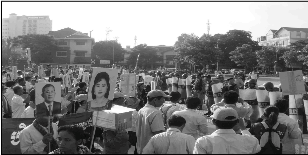
Figure 7.1: Over 200 villagers from 24 provinces and towns in Cambodia came to Phnom Penh on 15 June 2010 to deliver a petition to the Prime Minister bearing the thumbprints of some 60,000 people urging him to help resolve countless land, forest and fishery disputes. The group intended to march from Wat Botum to the Prime Minister's house but were blocked by military and municipal police armed with batons, shields, tear gas and pistols. 15 June 2010.

The crackdown on freedom of expression has not been limited to actions to prevent the distribution of written materials but has extended to efforts to curb peaceful protests and demonstrations. In 2009 there were 156 strikes and demonstrations in Cambodia, 71 cases protesting over land conflict, 37 over labour rights and working conditions and 48 related to other matters. 176 Of these 156 strikes, 34 were violently interrupted by the authorities, although strikers and demonstrators did not use or provoke any violence. 177 The demonstrations have related to all sorts of issues in the public interest, from protests demanding compensation from the Thai government in respect of the fighting at Preah Vihear to protests about land reform and illegal economic and social land concessions. Many of the land protests have ended with violence and arrest. On 1 March 2010, villagers from Proka Village in Dangkor District, who are involved in a land dispute with In Samon, the Deputy Secretary General of the Ministry of Interior, attempted to hold a demonstration outside the home of Prime Minister Hun Sen in Takhmao. After confrontations with villagers, the police arrested eight villagers. They were detained and eventually released but only after succumbing to threats by the police of imprisonment if they refused to thumb-print documents withdrawing their complaints about the land. 178