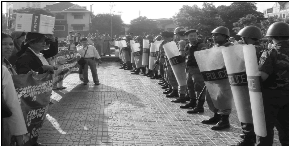
Figure 2.2: Peaceful demonstration in Phnom Penh blocked by riot police.