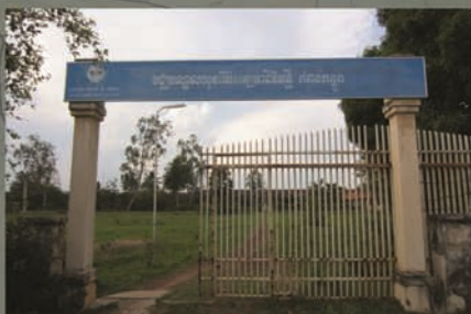
Kampong Kantuot “Youth Rehabilitation Center”

11.413N, 104.8251E Run by: Social Affairs Ministry