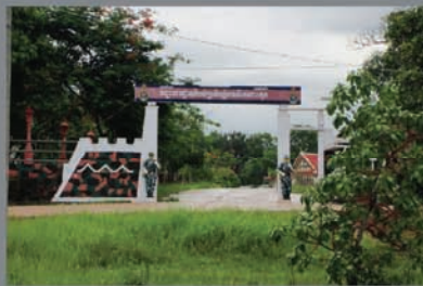
Koh Kong Military Center 11.6204N, 103.0075E Run by: Military Approximate capacity: 30