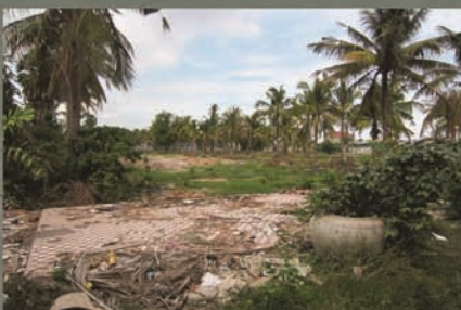
Choam Chao “Youth Rehabilitation Center”

11.413N, 104.8251E Run by: Social Affairs Ministry