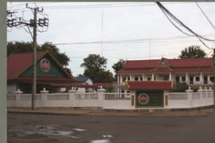
Kampong Cham Gendarme Center

11.5329N, 104.834E Run by: Social Affairs Ministry