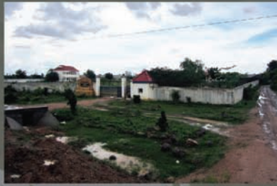
Battambang Bavel Police Center 13.1773N, 102.8141E Run by: Police Approximate capacity: 100