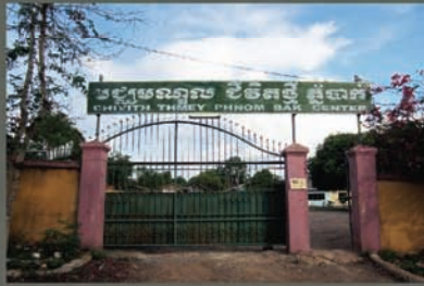
Banteay Meanchey Phnom Bak Center 13.5882N, 102.9348E Run by: Social Affairs Ministry Approximate capacity: 120