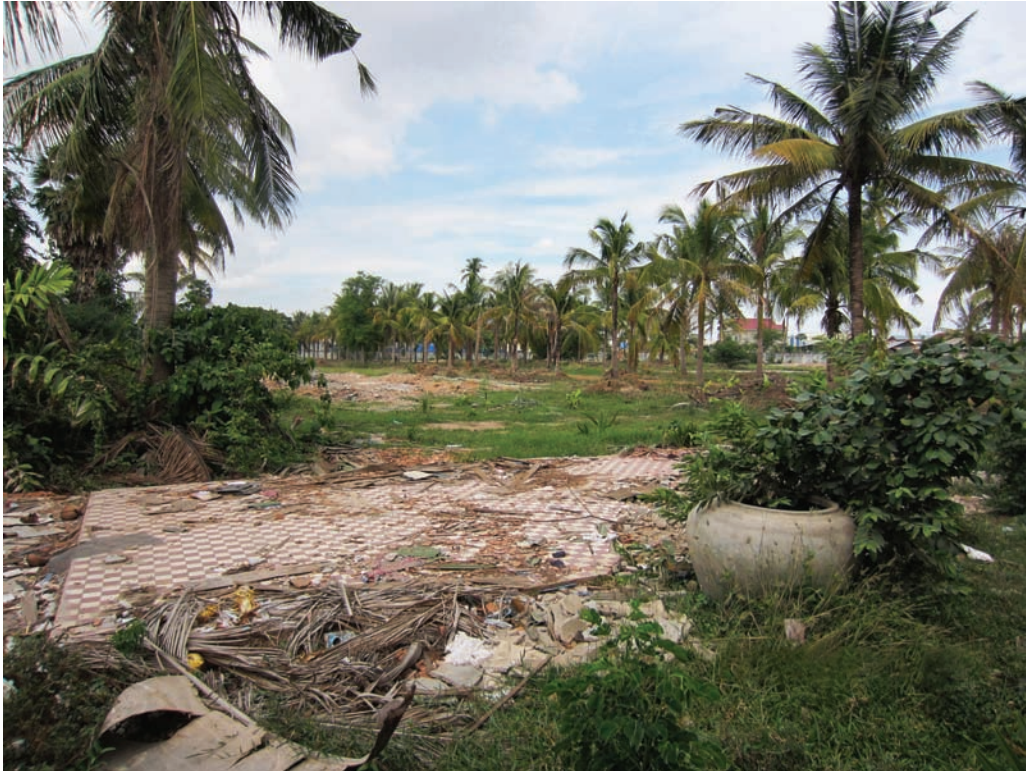
The frond-strewn floor of a former building inside the Choam Chao “Youth Rehabilitation Center” in Phnom Penh. Cambodia closed the center in 2010.

One of the three centers closed since 2010 was the Choam Chao “Youth Rehabilitation Center,” which was situated in Phnom Penh and run by the Ministry of Social Affairs up until 2010. The center had the capacity to detain approximately 100 people. It ceased to operate in mid-2010 after the United Nations Children’s Fund, UNICEF, which had provided funding since 2006, confirmed reports of abuses against detainees and stopped funding the center. 26 In late 2012, the center’s buildings were demolished.