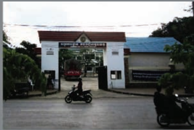
Battambang Gendarmerie Center 13.0952N, 103.1958E Run by: Gendarmerie Approximate capacity: 100