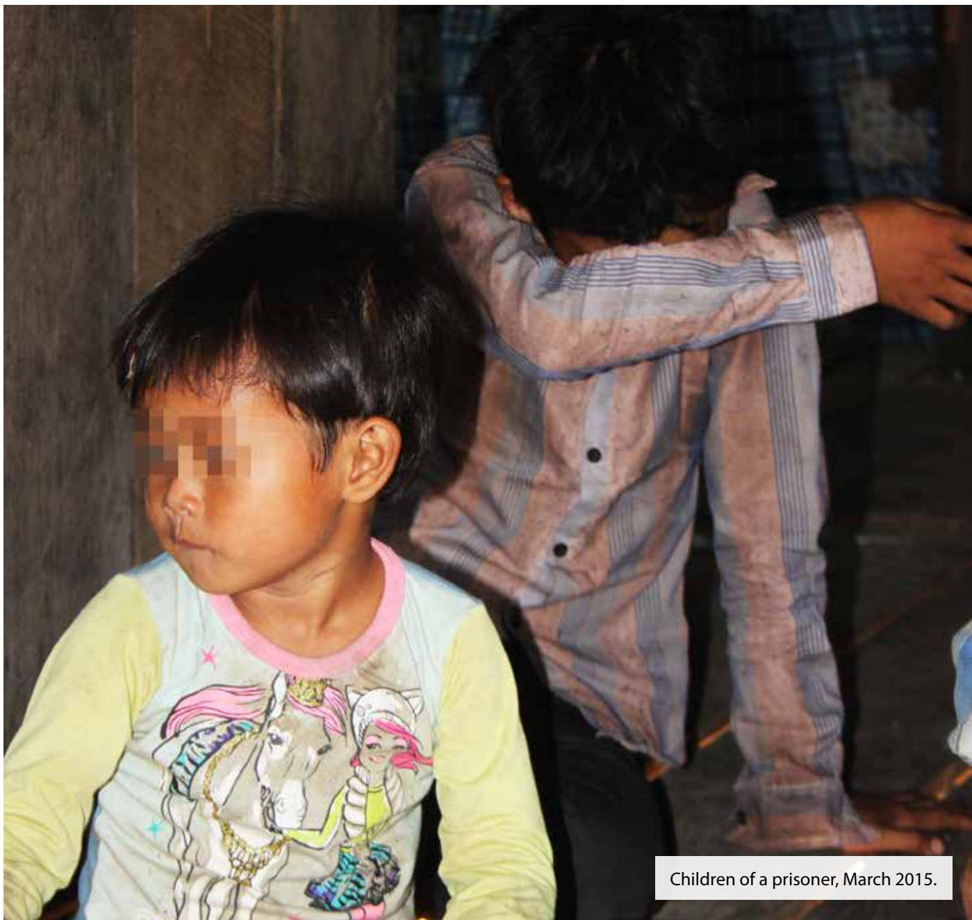
Children of a prisoner, March 2015.