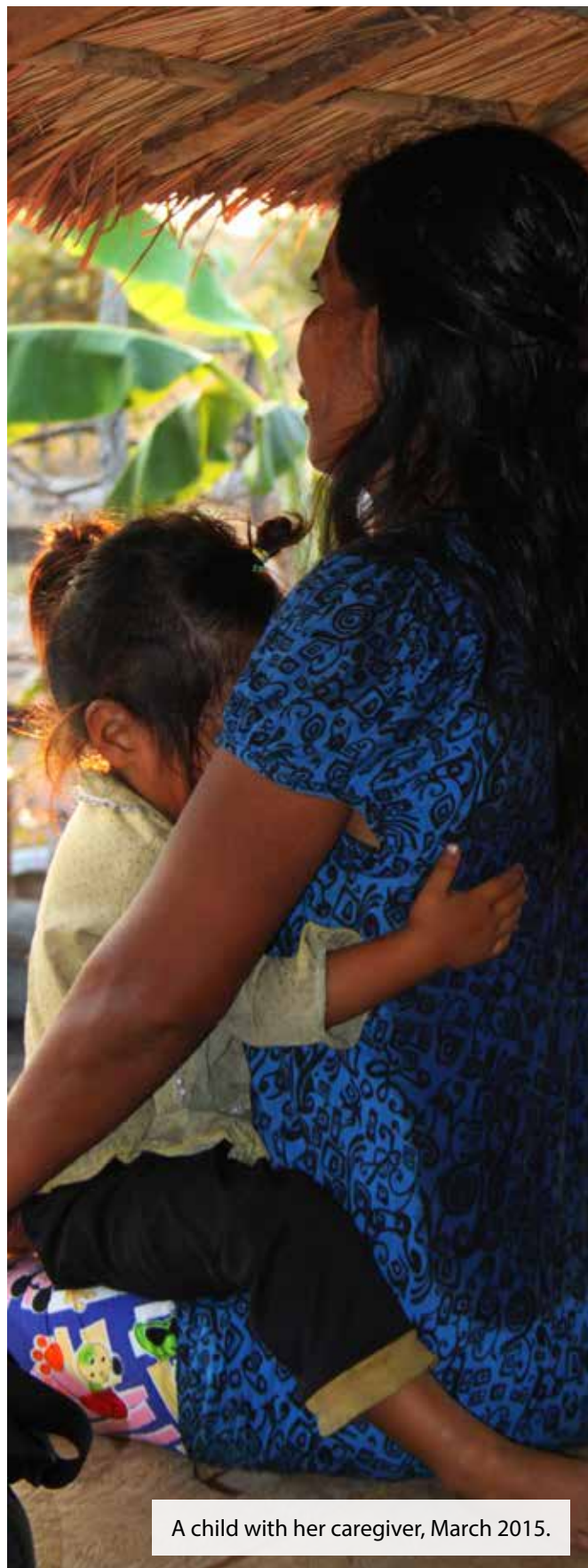
A child with her caregiver, March 2015.

In the longer-term, prison authorities should consider introducing a system to allow mothers to visit their children at home for short periods of time, if it is safe and