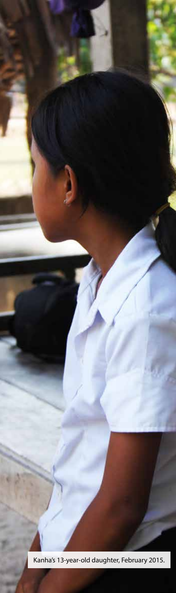
Kanha's 13-year-old daughter, February 2015.