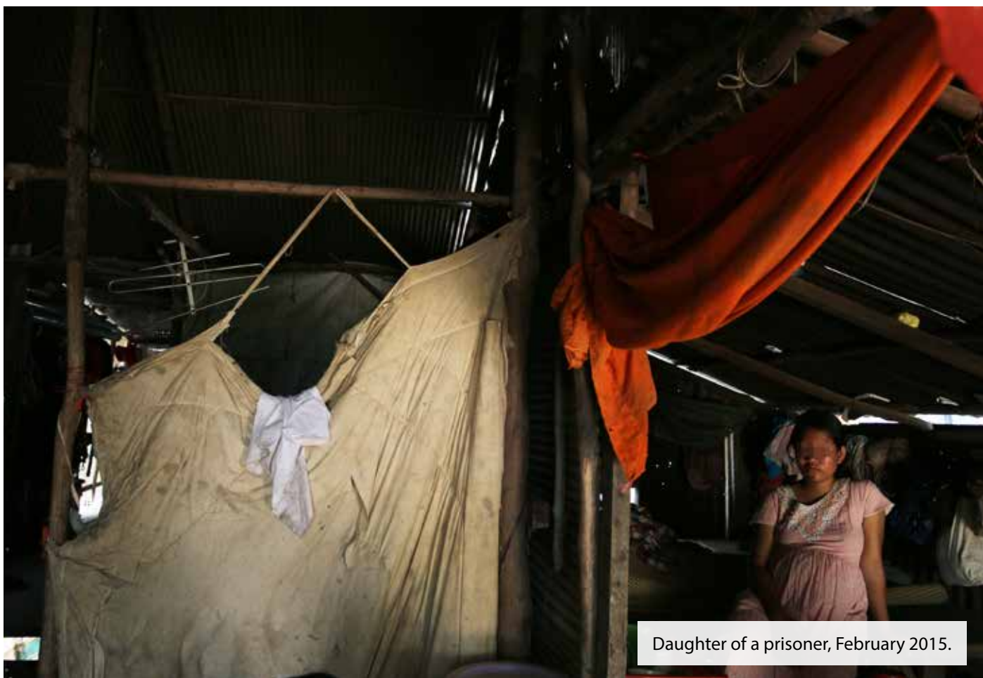
Daughter of a prisoner, February 2015.