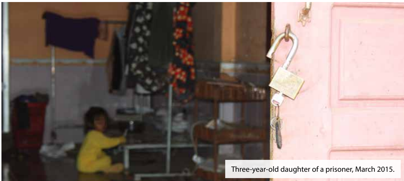
Three-year-old daughter of a prisoner, March 2015.