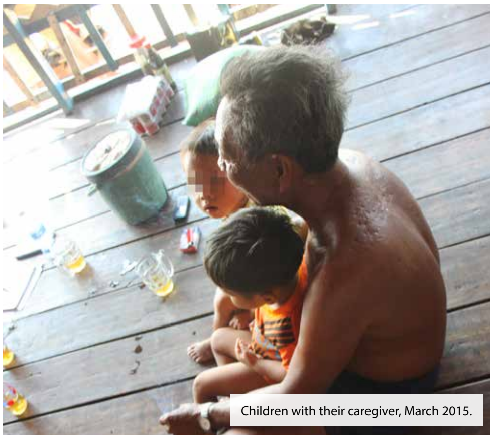
Children with their caregiver, March 2015.

The disparities in the way such cases have been handled explain why some mothers had been able to keep their children in prison and others had not. LICADHO also notes that some women who had decided to find alternative care arrangements for their children outside prison unwittingly jeopardised their chances of early release or expedited trial.