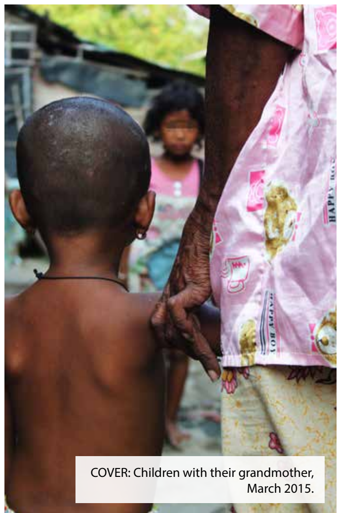
COVER: Children with their grandmother, March 2015.