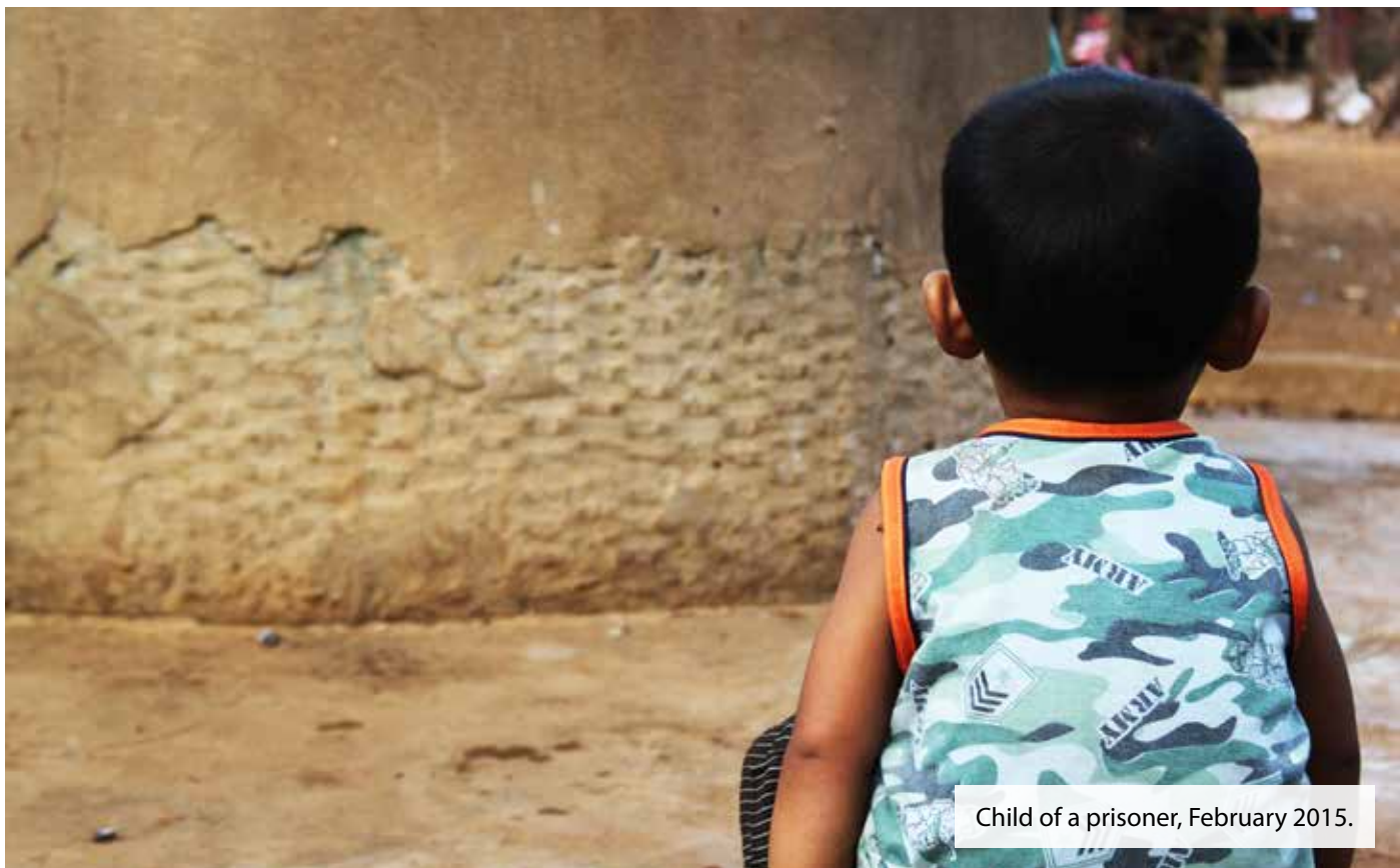
Child of a prisoner, February 2015.