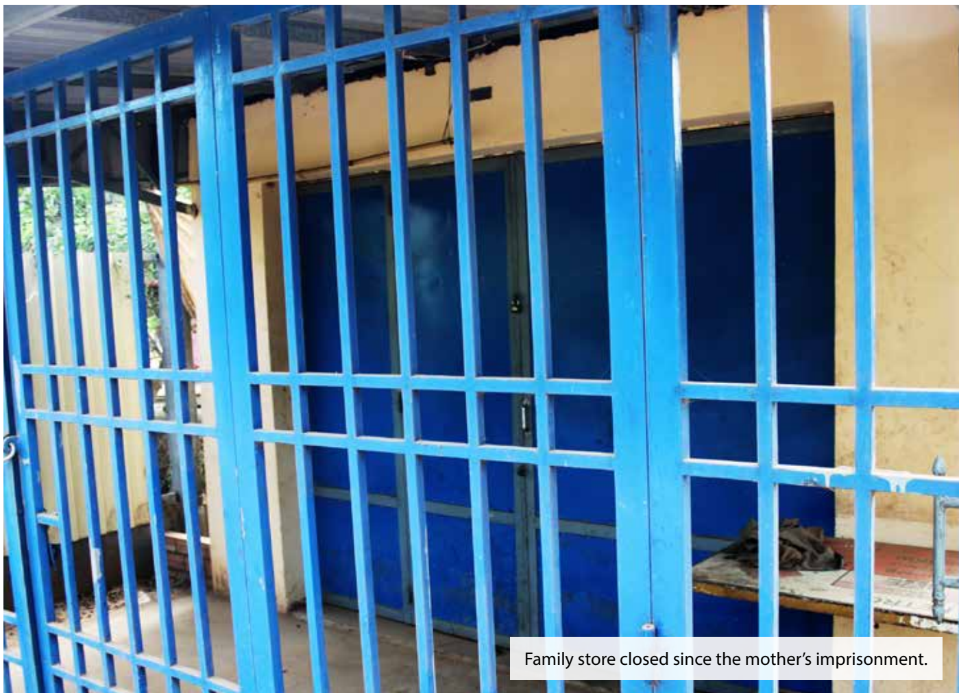
Family store closed since the mother's imprisonment.